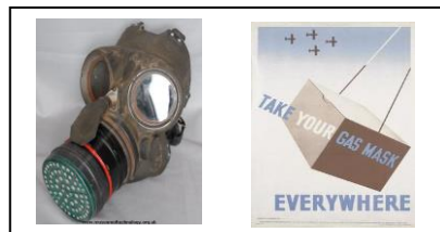
Gas masks issued