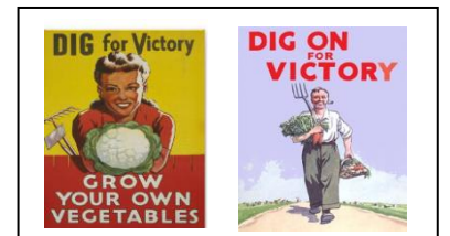
Encourage people to grow their own food