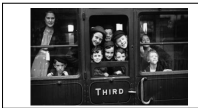
Evacuation of children

Arrange them in your diamond nine starting with those you think would be least important.