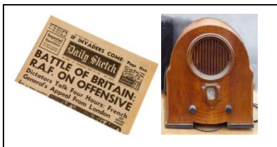
Keep people informed