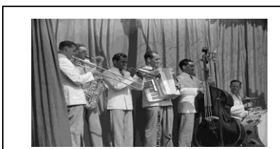
Keeping people cheery